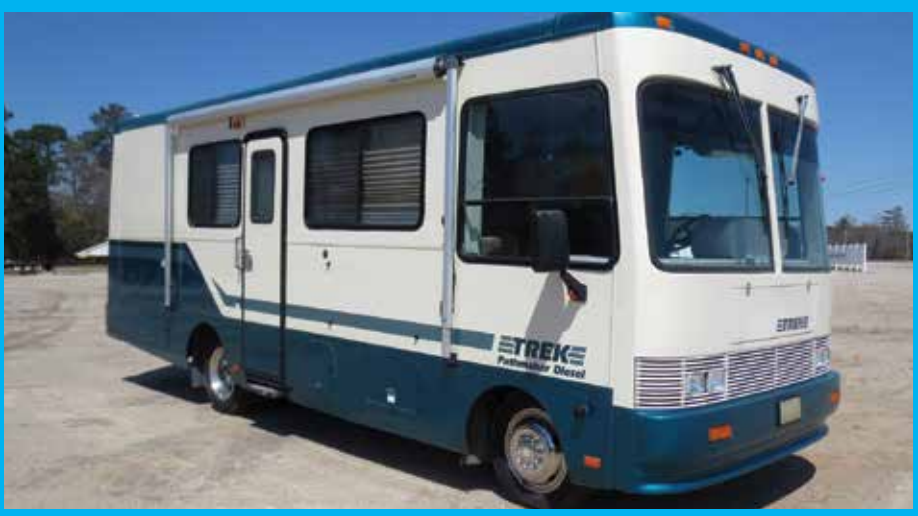
1995 SAFARI TREK 2430 MOTOR HOME