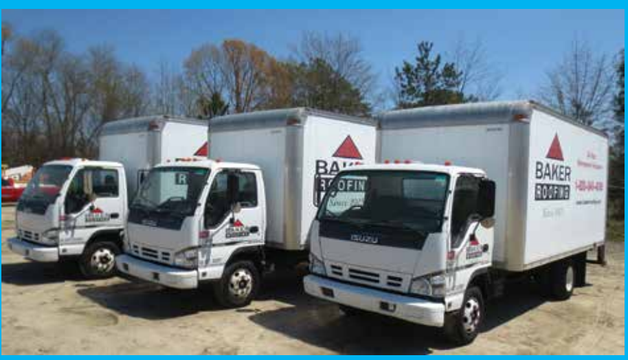
3 OF 4 - 2006 ISUZU NPR DY VAN CARGOS