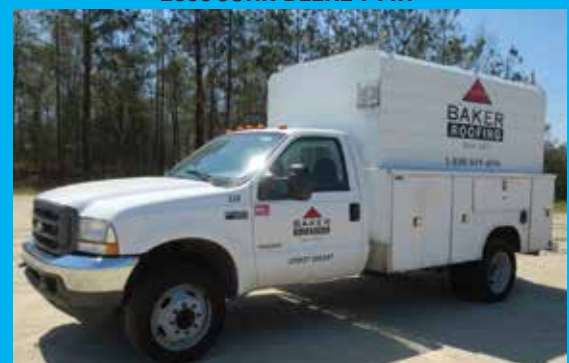
2004 FORD F-450XL SUPERDUTY DUALLY