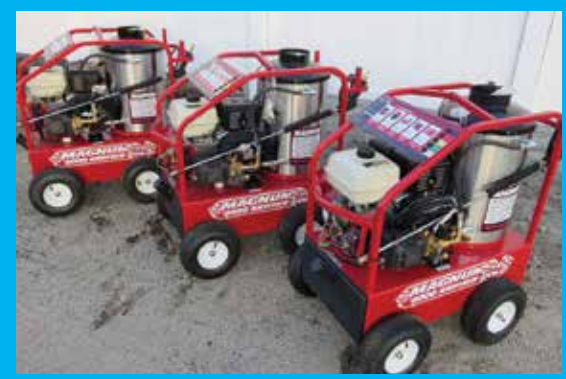
UNUSED MAGNUM GOLD SERIES HOT WATER PRESSURE WASHERS