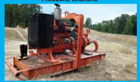
LARGE SELECTION OF SUPPORT EQUIPMENT ITEMS