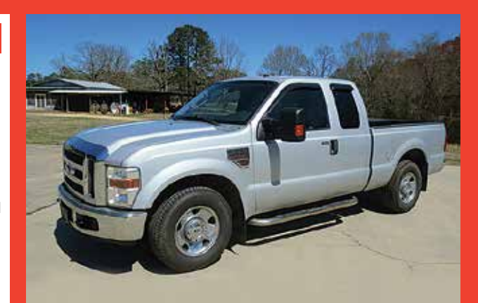
2008 FORD F-250XLT EXTENDED CAB - 47,893 miles

sn:4XSCB13153G045418, equipped w/ 6 ft x 13 ft enclosed V-Nose body, 2,980LB hauling capability, side and rear entrances, single axle, ST205/75R 15 tires