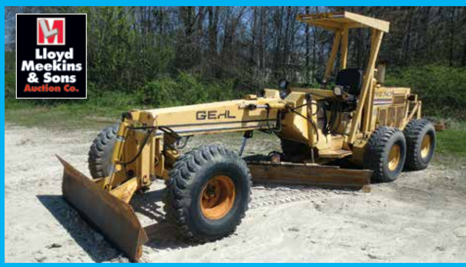
1 OF 2 - GEHL 747 MOTOR GRADERS