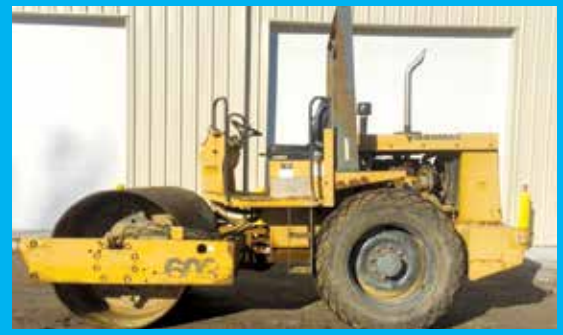
1998 VIBROMAX 602D