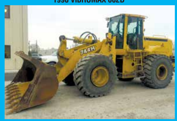
2000 JOHN DEERE 744H