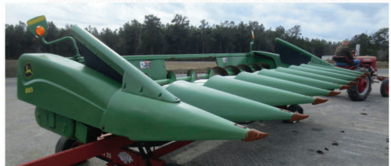
2006 JOHN DEERE 893 - 2005 UNVERFERTH HT25 HEADER TRAILER