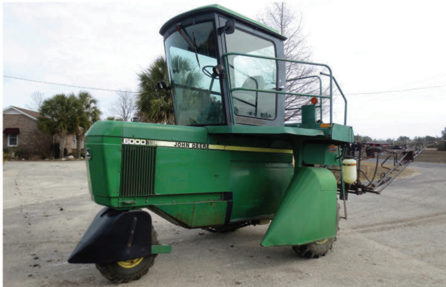
JOHN DEERE 6000 HI-CYCLE SPRAYER