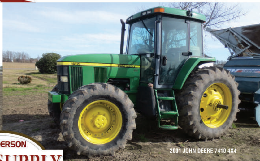
2001 JOHN DEERE 7410 4X4