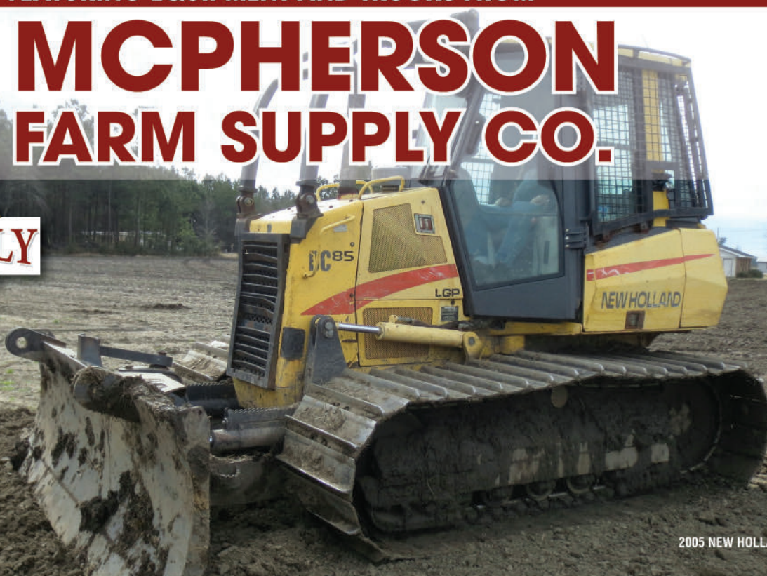
2005 NEW HOLLAND DC85 LGP

THURSDAY, FEBRUARY 26, 2015 • 10:00AM • CHADBURN, NORTH CAROLINA