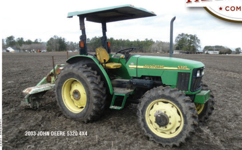
2003 JOHN DEERE 5320 4X4