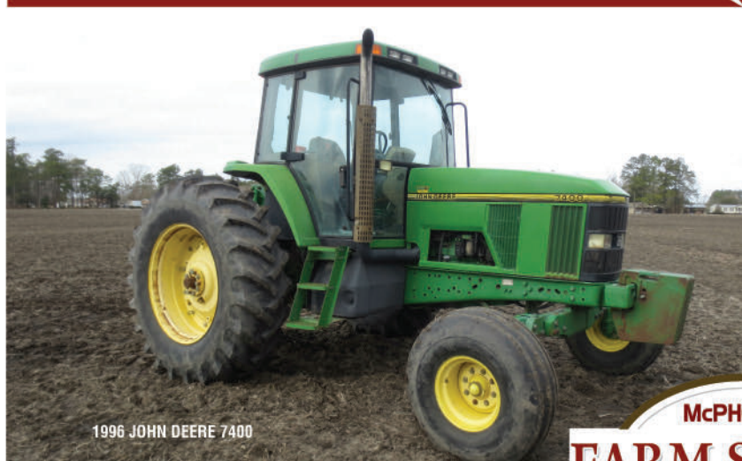
1996 JOHN DEERE 7400

THURSDAY, FEBRUARY 26, 2015 10:00 AM • CHADBOURN, NC