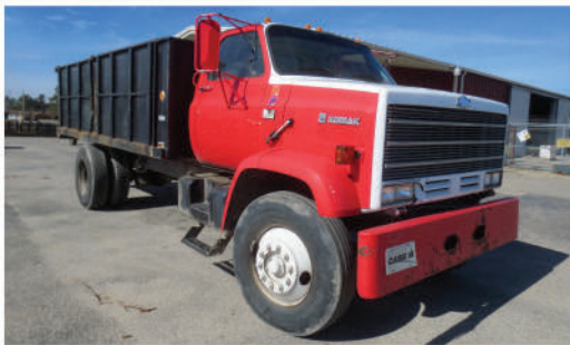
CHEVROLET KODIAK 70 GRAIN DUMP TRUCK