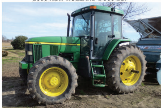
2001 JOHN DEERE 7410 ROW-CROP 4X4