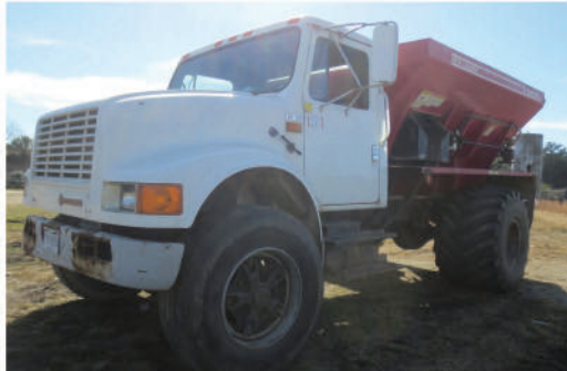
INTERNATIONAL 4700 - NEW LEADER L2020GT-11 FERTILIZER SPREADER TRUCK