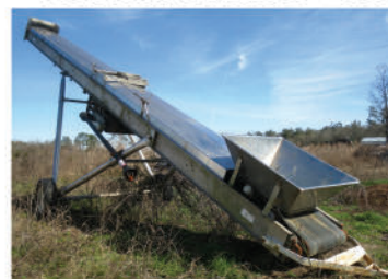
2009 AGRICRAFT 24 X 30 PORTABLE CONVEYOR