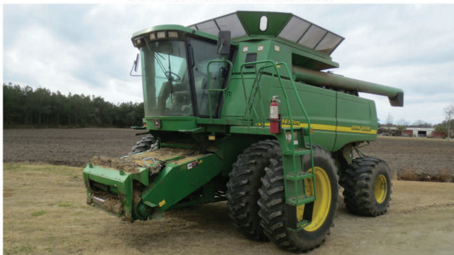
2001 JOHN DEERE 9650STS 4WD