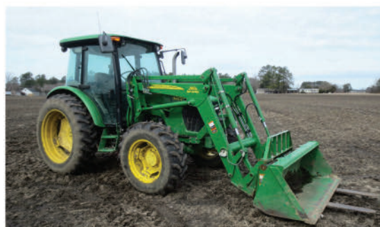
2009 JOHN DEERE 5095M 4X4