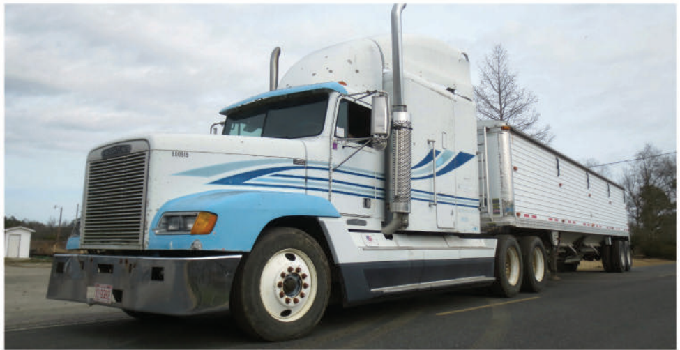
1993 FREIGHTLINER FLD120064 - 2003 TIMPTE SUPER HOPPER