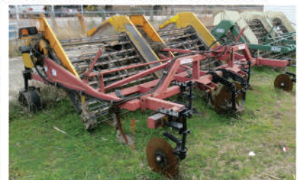
W. & A. 6236 4-ROW PEANUT INVERTER

Modification: D:\20150210152620-05\007 Producer: Adobe PDF Library 11.0 Creation Date: D:\20150210152620-05\007 WD 100 \rsi\luc\ C:\175615 X:\175615 Y:\175615 [ TRAP ABO:100 Sealing Percent \\\naspress-rip\01_Jobs\112430 Meekins\EPS-PDF for Rampage\112430 catalog.pdf Page 6 Creator: Adobe InDesign CC 2014 (Macintosh) 2400.0 dpi (Screened Data File POS, Right-Reading, Color-Seps, Std-CMYK Simulated Spot Colors) [ TRAP ABO:100 Sealing Percent PS Version: 3015.102 HON Version 9.0 Revision 2 RSL, Ripped on Tuesday, February 10, 2015 3:29:37 PM Cyan Magenta Yellow Black ID: Kelley