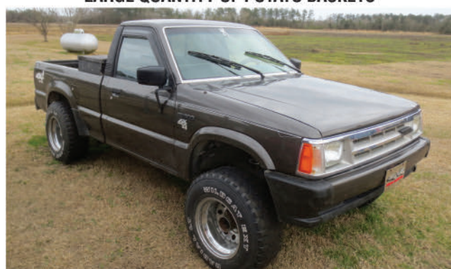
1987 MAZDA B2600 4X4