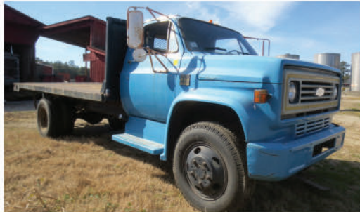
1977 CHEVROLET C60 FLATBED TRUCK