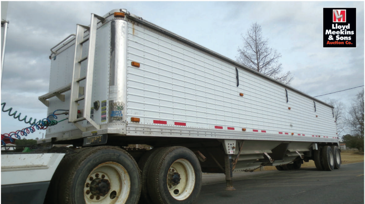
2003 TIMPTE SUPER HOPPER 42 FT GRAIN TRAILER