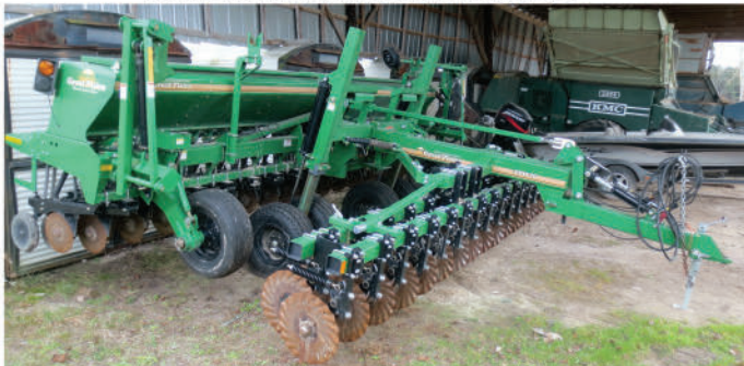
2013 GREAT PLAINS 2000 NO-TILL GRAIN DRILL