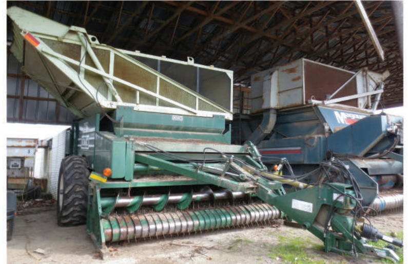
KMC KELLEY 3374 4-ROW PEANUT COMBINE