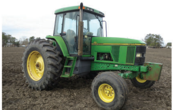
1996 JOHN DEERE 7400 ROW-CROP