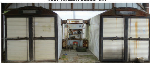
1 OF 5 - TAYLOR TOBACCO CURER BOX BARNs