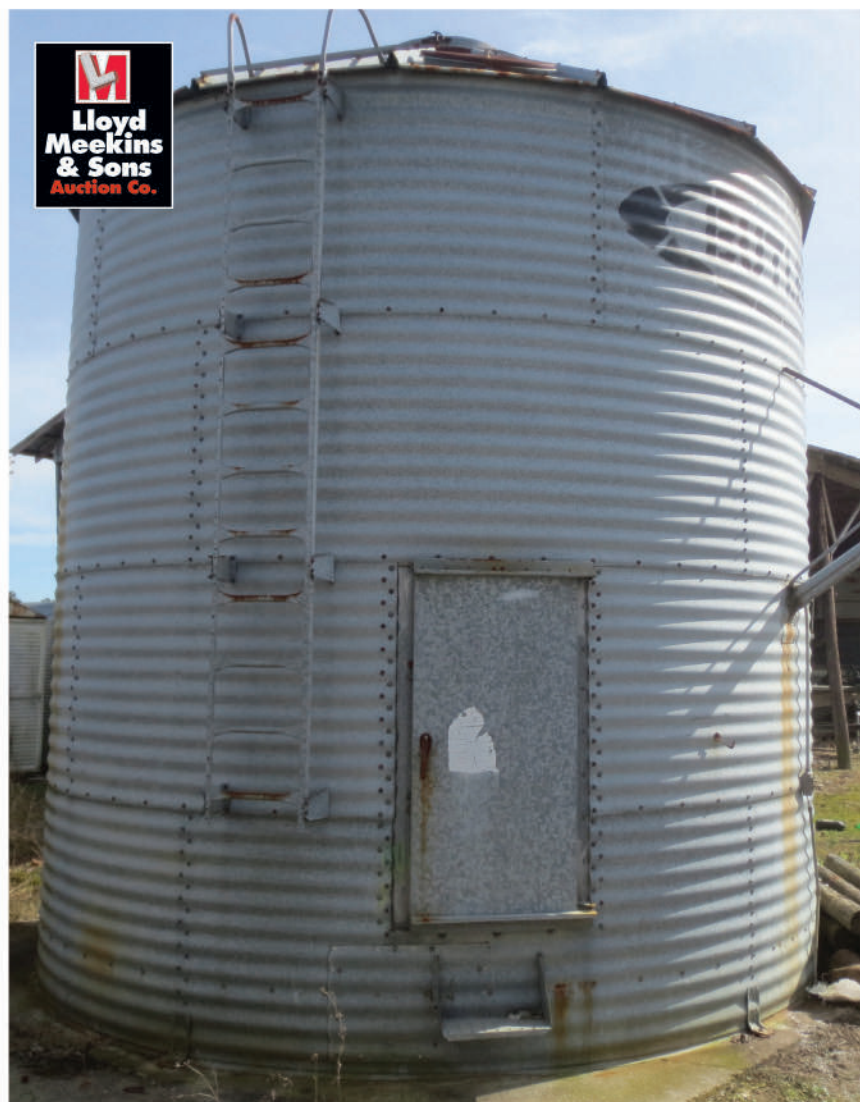
BUTLER 1850 BUSHEL CAPACITY GRAIN BIN

sn:BUJ80156F494, equipped w/ Mercury Tracker Pro Series 75HP outboard engine, 17 ft fiberglass body, Tracker Pro Series 35 trolling motor, Hummingbird Wide View depth finder and fishing accessories included, 1995 Tracker Trailstar Boat Trailer, sn:4TM13AE13SB001085, equipped w/ Cooper Cobra P195/70R 13 Radial G/T tires, single axle