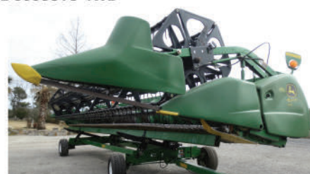
2006 JOHN DEERE 625F HYDRAFLEX - 2009 UNVERFERTH HT25 HEADER TRAILER