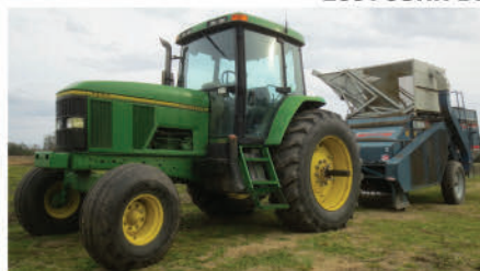
1995 JOHN DEERE 7400 - HOBBS 8557 MAGNUM PEANUT COMBINE