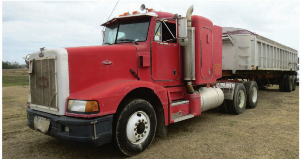
1989 PETERBILT 377 - HILL 36 FT ALUMINUM END DUMP TRAILER