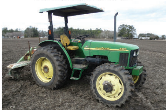
2003 JOHN DEERE 5320 4X4