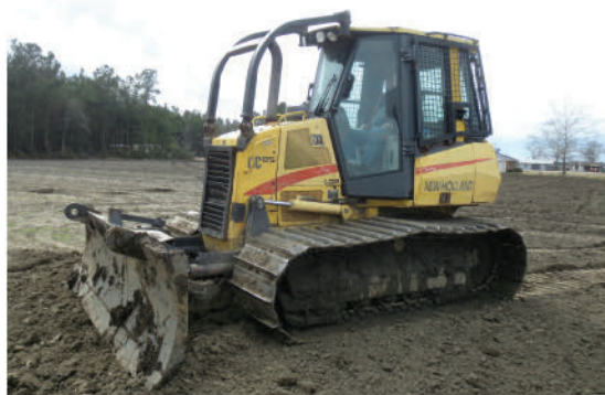
2005 NEW HOLLAND DC85 LGP