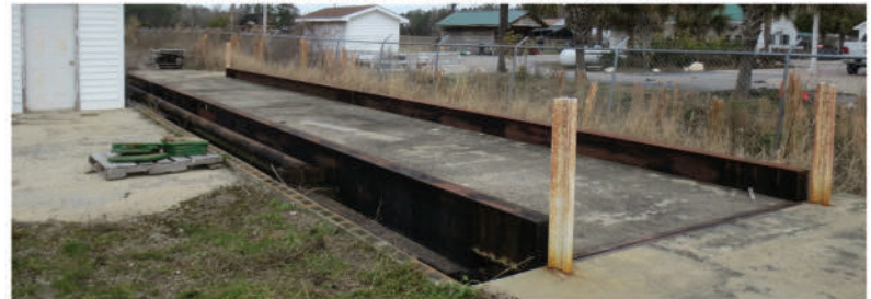
THURMAN SCALE 60 X 10 MECHANICAL PIT TRUCK SCALE