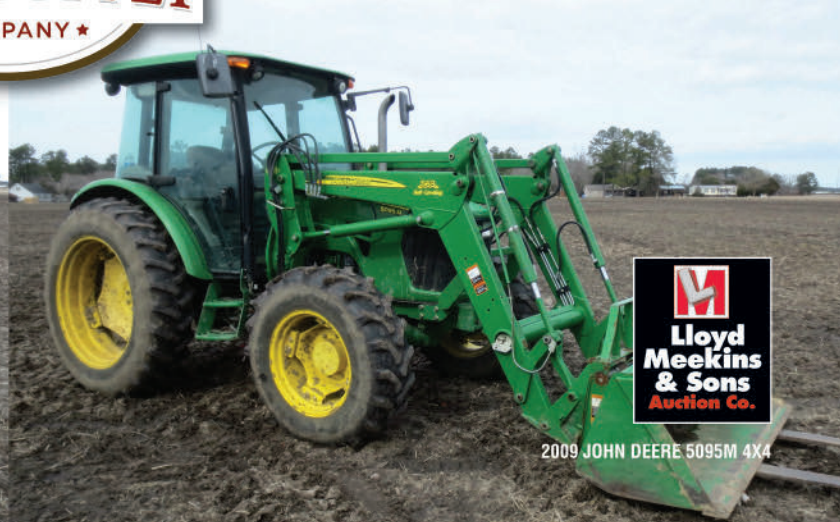
2009 JOHN DEERE 5095M 4X4