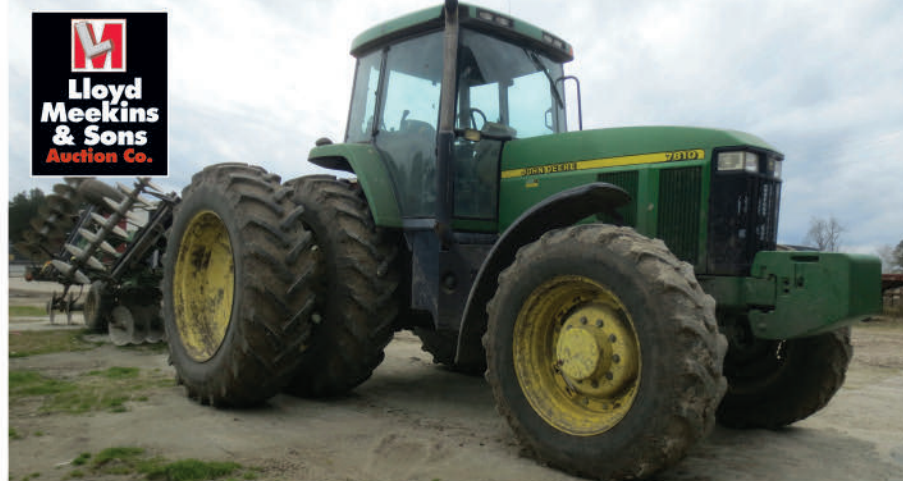
1998 JOHN DEERE 7810 ROW-CROP 4X4