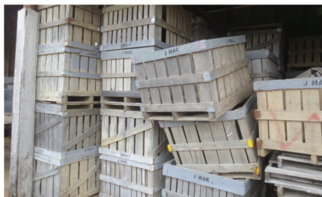
LARGE QUANTITY OF POTATO BASKETS