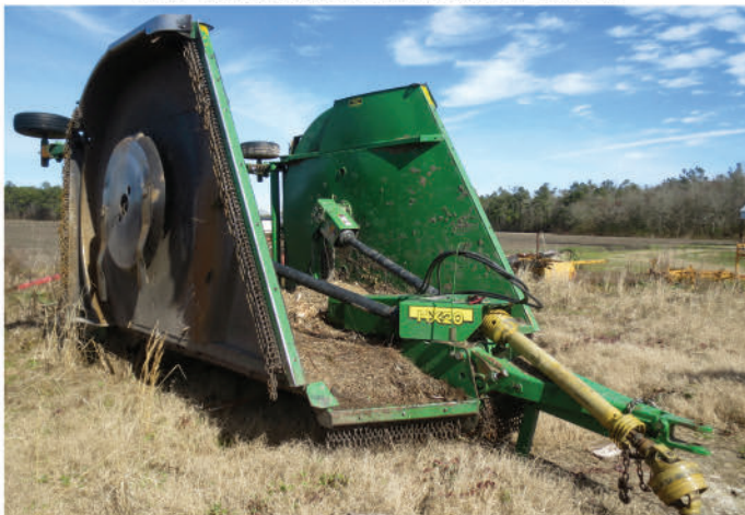
JOHN DEERE HX20 BATWING CUTTER