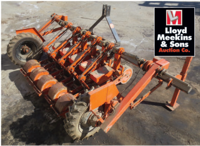
STANHAY S870 PRECISION BELT PLANTER