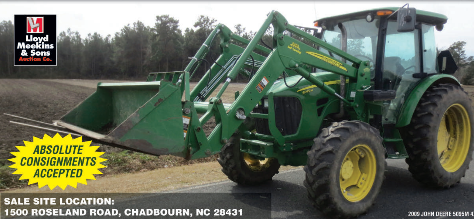
2009 JOHN DEERE 5095M 4X4