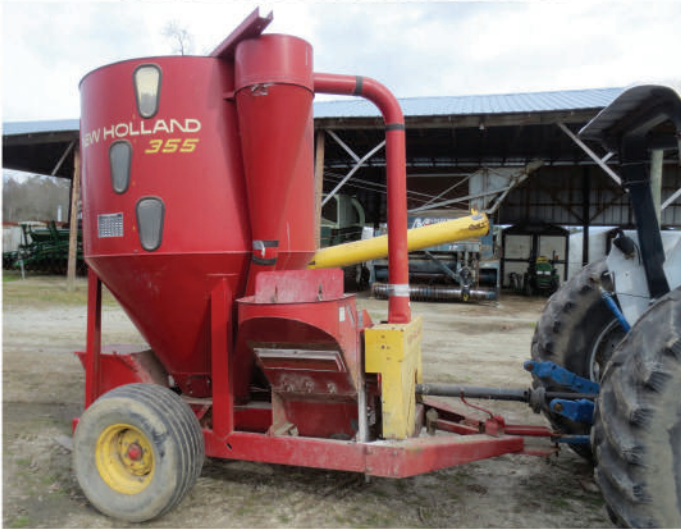
NEW HOLLAND 355 PORTABLE FEED MILL