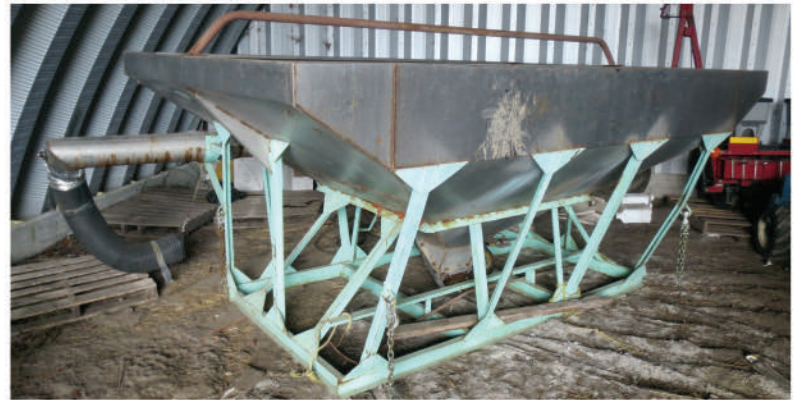
AGRICRAFT M65 SIDE DISCHARGE TENDER