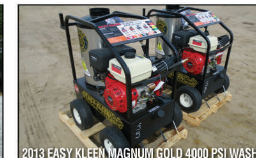
2013 EASY KLEAN MAGNUM GOLD 4000 PSI WASHERS