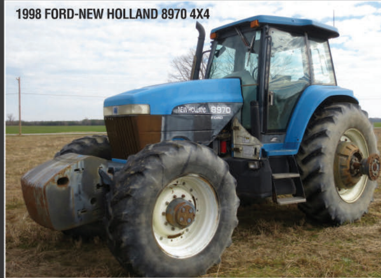
1998 FORD-NEW HOLLAND 8970 4X4