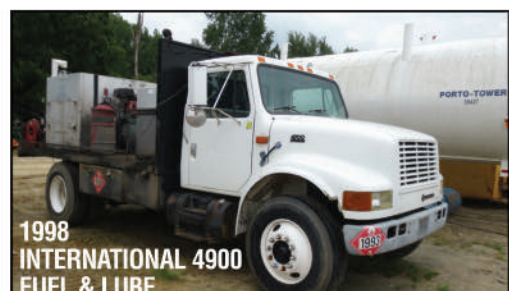
1998 INTERNATIONAL 4900 FUEL & LUBE