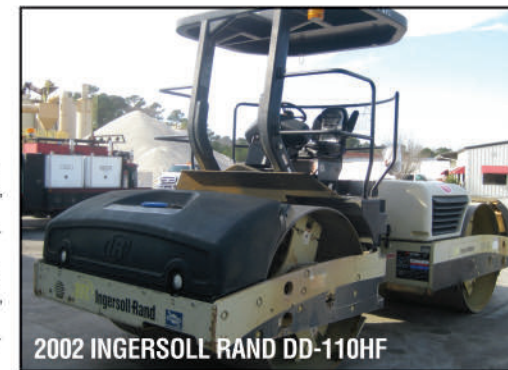
2002 INGERSOLL RAND DD-110HF