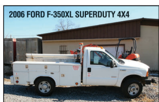
2006 FORD F-350XL SUPERDUTY 4x4