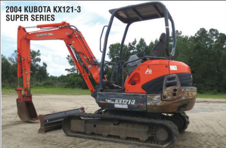
2004 KUBOTA KX121-3 SUPER SERIES