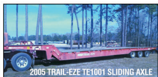
2005 TRAIL-EZE TE1001 SLIDING AXLE