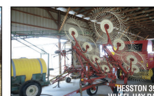
HESSTON 3983 WHEEL HAY RAKE