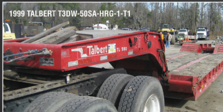
1999 TALBERT T3DW-50SA-HRG-1-T1