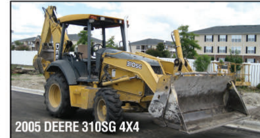
2005 DEERE 310SG 4x4