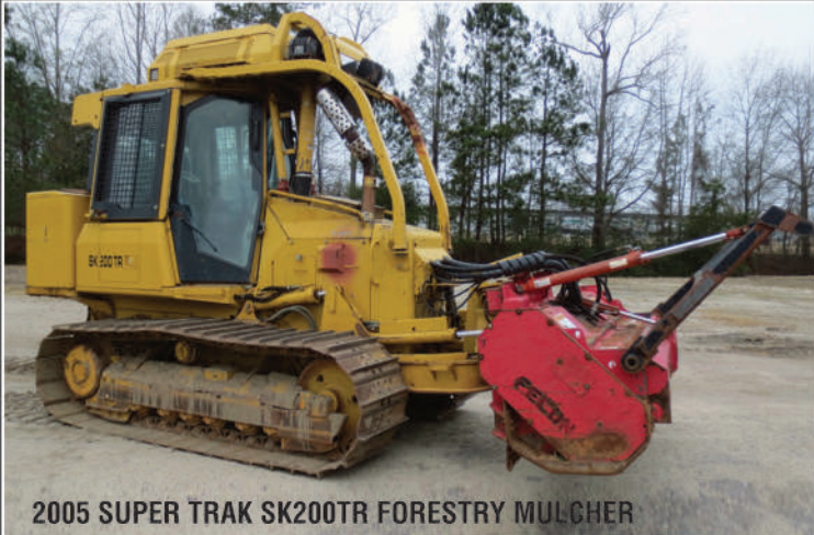
2005 SUPER TRAK SK200TR FORESTRY MULCHER