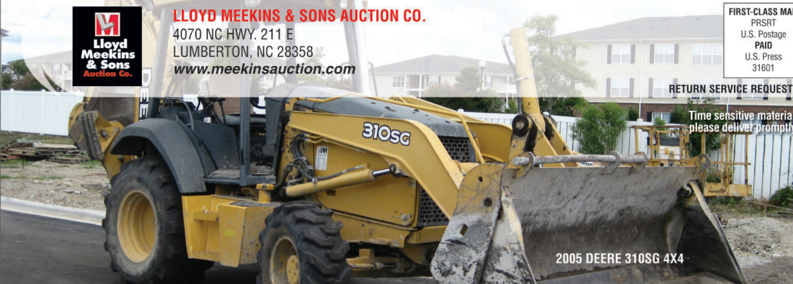
2005 DEERE 310SG 4X4