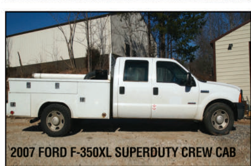
2007 FORD F-350XL SUPERDUTY CREW CAB