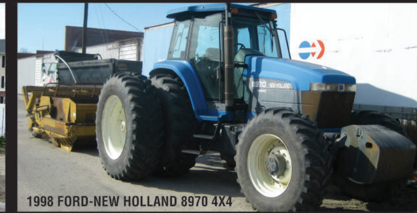
1998 FORD-NEW HOLLAND 8970 4X4