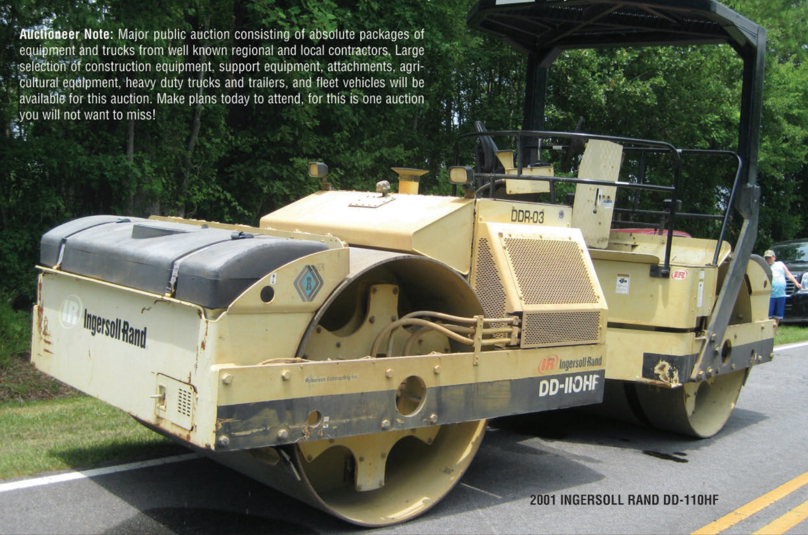
2001 INGERSOLL RAND DD-110HF

Auctioneer Note: Major public auction consisting of absolute packages of equipment and trucks from well known regional and local contractors. Large selection of construction equipment, support equipment, attachments, agricultural equipment, heavy duty trucks and trailers, and fleet vehicles will be available for this auction. Make plans today to attend, for this is one auction you will not want to miss!