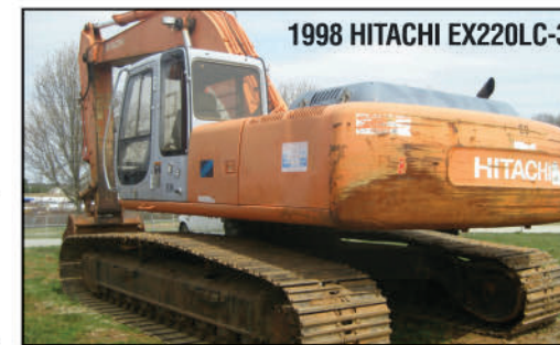
1998 HITACHI EX220LC-3