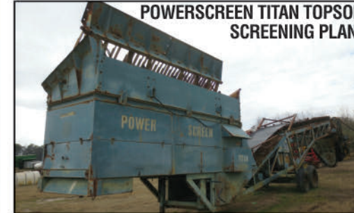
POWERSCREEN TITAN TOPSOIL SCREENING PLANT