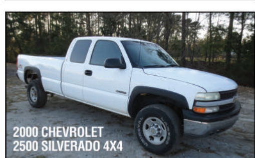
2000 CHEVROLET 2500 SILVERADO 4x4