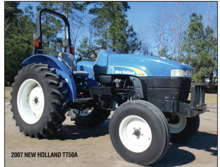
2007 NEW HOLLAND TT50A

M & W LC1890V Front Deck Mower , sn:012707012, gas engine, zero turn radius, 60 inch deck, 1,277 hrs