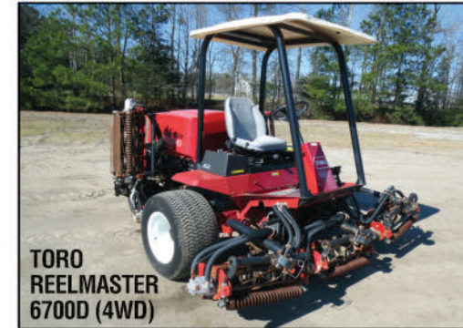
TORO REELMASTER 67000 (4WD)