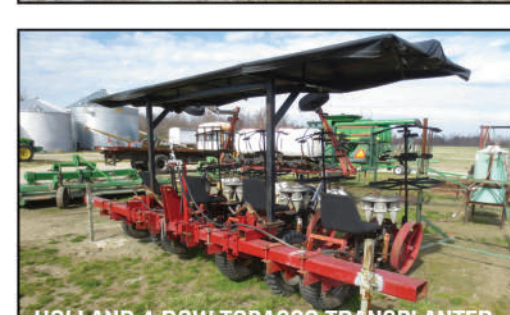
HOLLAND 4-ROW TOBACCO TRANSPLANTER