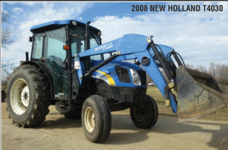
2008 NEW HOLLAND T4030