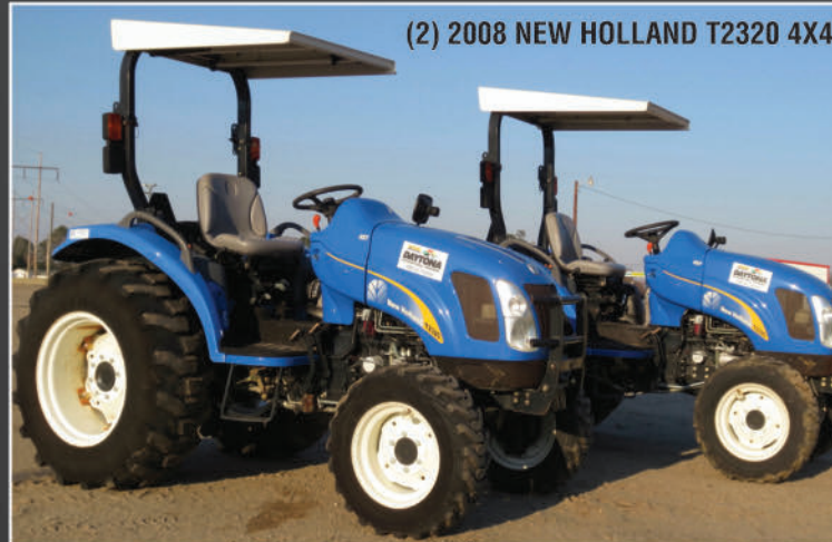
(2) 2008 NEW HOLLAND T2320 4X4