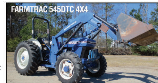
FARMTRAC 545DTC 4x4