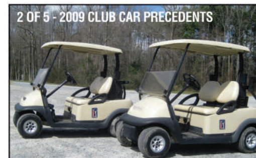
2 OF 5 - 2009 CLUB CAR PRECEDENTS

Attachments, Compact Support Equipment, Air Compressors, Shop Equipment, Contractor Grade Hand Tools and Accessories, Job Safety Equipment and Supplies, Construction Equipment Attachments, Truck and Auto Accessories, Equipment Parts and Accessories, Consumer Items, misc items - see website for complete listing with descriptions and pictures at meekinsauction.com - Inventory Updated Daily