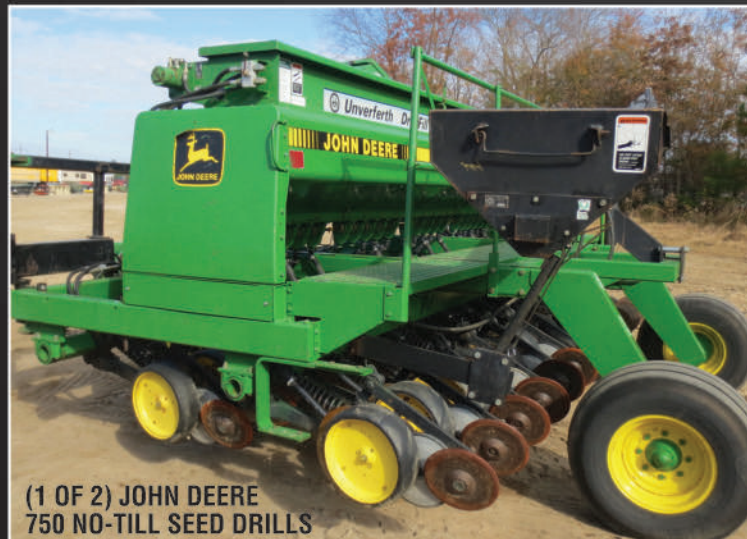
(1 OF 2) JOHN DEERE 750 NO-TILL SEED DRILLS