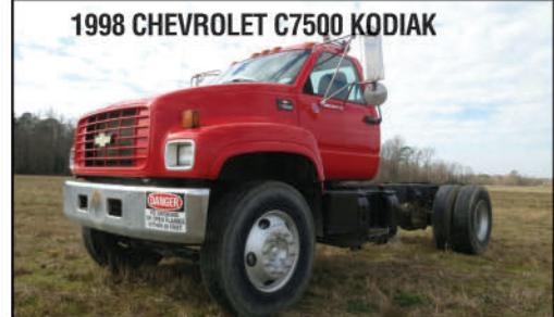
1998 CHEVROLET C7500 KODIAK

2013 Top Line JT-10 FA , sn:4UMJT1013DM000018, equipped w/ 3,500LB hauling capability, 5 ft x 10 ft deck, wood floor, single axle, loading tailgate, P215/70R 15 tires