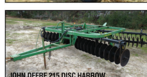
JOHN DEERE 215 DISC HARROW