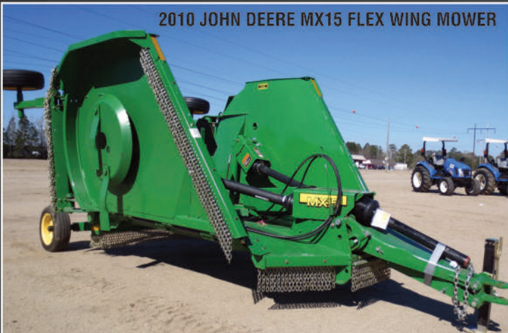
2010 JOHN DEERE MX15 FLEX WING MOWER