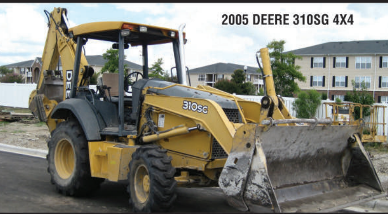
2005 DEERE 310SG 4X4