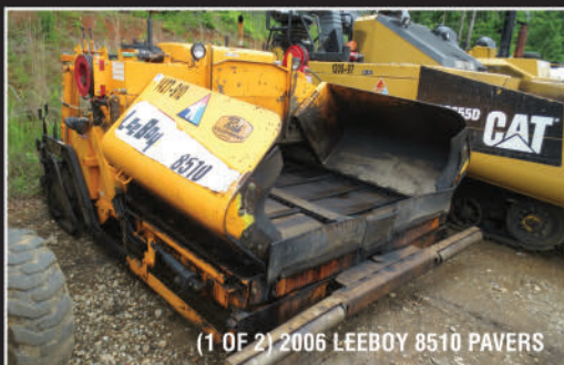
(1 OF 2) 2006 LEEBOY 8510 PAVERS