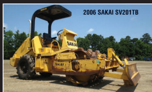
2006 SAKAI SV201TB