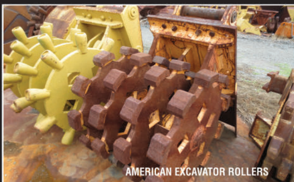
AMERICAN EXCAVATOR ROLLERS