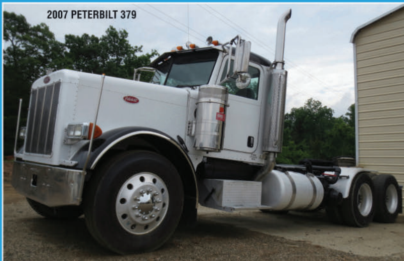
2007 PETERBILT 379