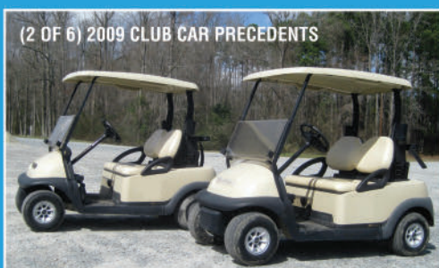
(2 OF 6) 2009 CLUB CAR PRECEDENTS