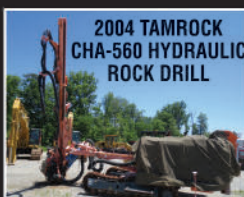
2004 TAMROCK CHA-560 HYDRAULIC ROCK DRILL