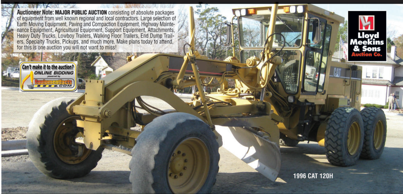
1996 CAT 120H