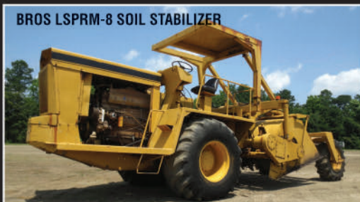
BROS LSPRM-8 SOIL STABILIZER

1989 Champion 720A , sn:720A1875961942489, equipped w/ Enclosed Cab, Cummins 8.3L engine, power shift transmission, work light package, front plow attachment, articulating frame, 12 ft board, scarifier, 17.5-25 tires, meter reading: 7,450 hrs 1996 John Deere 670B , sn:DW670BX559386, equipped w/ Enclosed Cab, John Deere 6068T engine, power shift transmission, hydraulic side shift and tilt, work light package, 12 ft board, articulating frame, ex county machine, meter reading: 9,402 hrs John Deere 570A , sn:005345T, equipped w/ Enclosed Cab, 6 cyl turbocharged engine, power shift transmission, articulating frame, scarifier, 12 ft blade, 17.5-25 tires, meter reading: 4,427 hrs