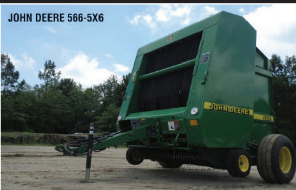
JOHN DEERE 566-5X6