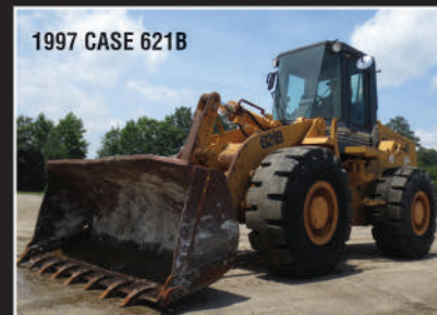
1997 CASE 621B