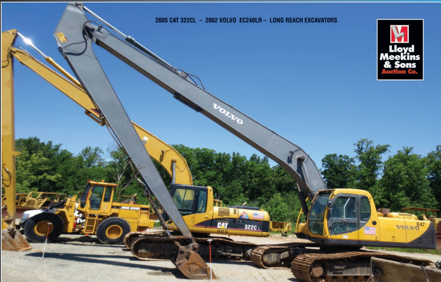
2005 CAT 322CL - 2002 VOLVO EC240LR - LONG REACH EXCAVATORS