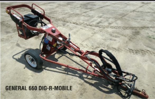
GENERAL 660 DIG-R-MOBILE