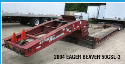
2004 EAGER BEAVER 50GSL-3