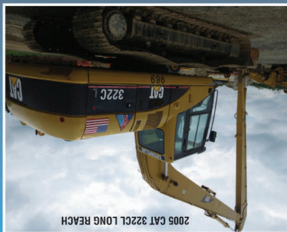
2005 CAT 322CL LONG REACH