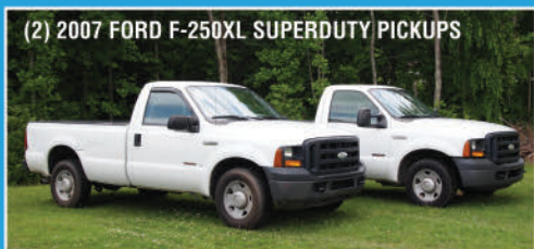
(2) 2007 FORD F-250XL SUPERDUTY PICKUPS