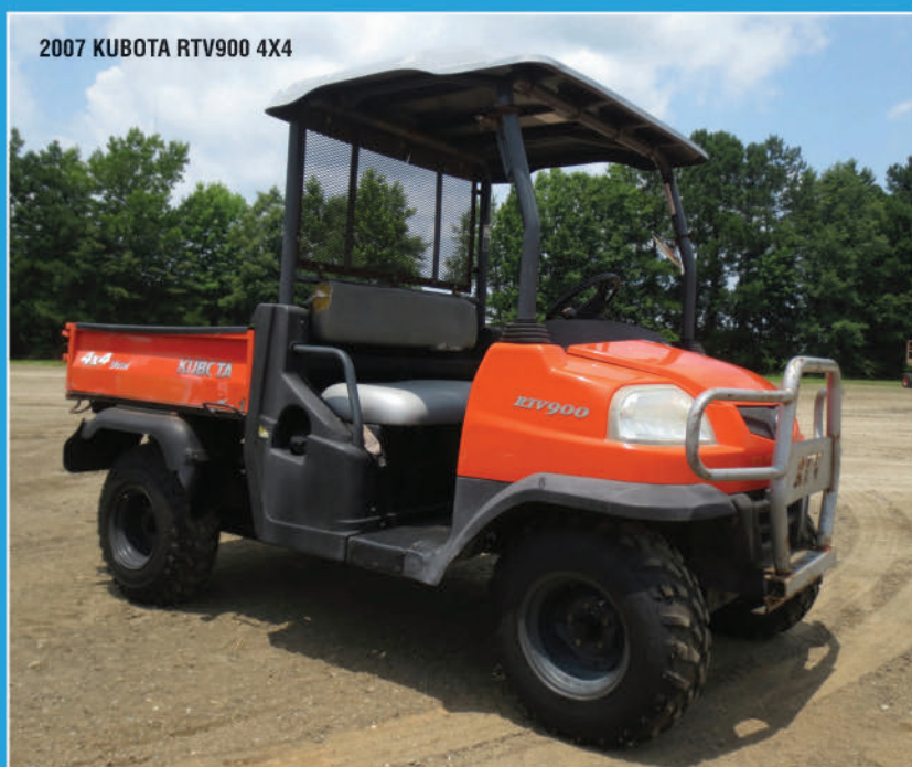
2007 KUBOTA RTV900 4X4

Over 400 New/Unused Tools to be sold at 9:00 am , also including Compact Support Equipment, Welding Equipment, Industrial Shop Equipment, Industrial Hot Water Pressure Washers, Light Duty Generator Sets, Water Pumps, Contractor Grade Hand Tools and Accessories, Job Safety Equipment and Supplies, Truck and Automobile Accessories, Equipment Parts and Accessories, antiques, misc items - see website for complete listing with descriptions and pictures meekinsauction.com - Inventory Updated Daily