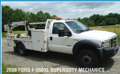
2006 FORD F-550XL SUPERDUTY MECHANICS