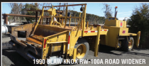
1990 BLAW KNOX RW-100A ROAD WIDENER