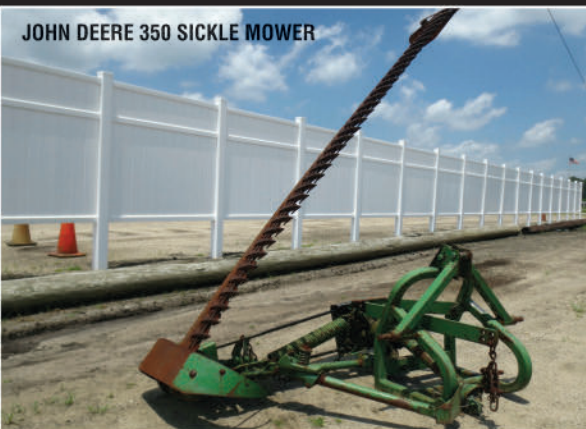
JOHN DEERE 350 SICKLE MOWER