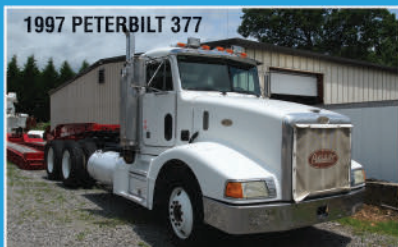
1997 PETERBILT 377