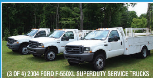
(3 OF 4) 2004 FORD F-550XL SUPERDUTY SERVICE TRUCKS