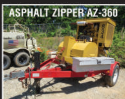
ASPHALT ZIPPER AZ-360