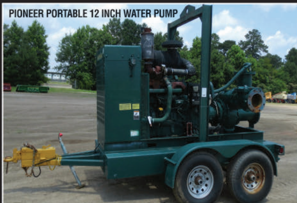
PIONEER PORTABLE 12 INCH WATER PUMP