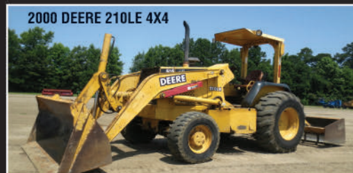
2000 DEERE 210LE 4X4