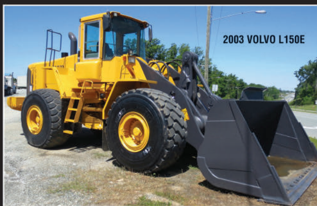
2003 VOLVO L150E