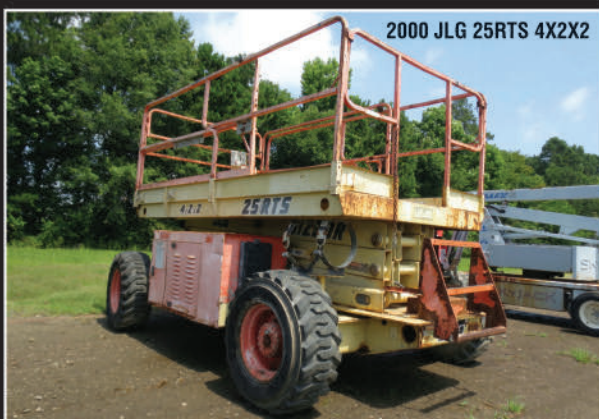
2000 JLG 25RTS 4X2X2