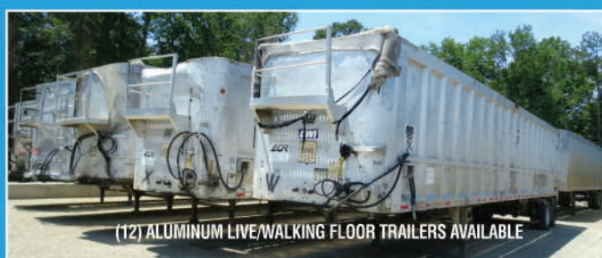
(12) ALUMINUM LIVE/WALKING FLOOR TRAILERS AVAILABLE