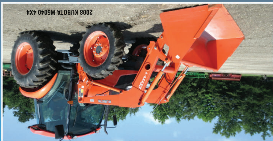
2008 KUBOTA M5040 4X4

For up-to-date auction inventory, with pictures and descriptions, visit our company website