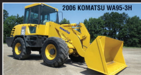
2006 KOMATSU WA95-3H