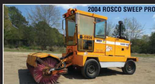
2004 ROSCO SWEEP PRO