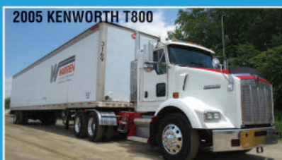
2005 KENWORTH T800