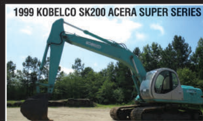
1999 KOBELCO SK200 ACERA SUPER SERIES