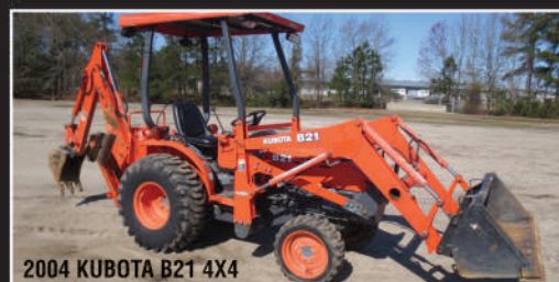
2004 KUBOTA B21 4X4