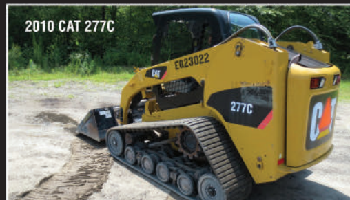
2010 CAT 277C