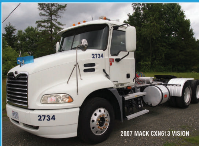
2007 MACK CXN613 VISION