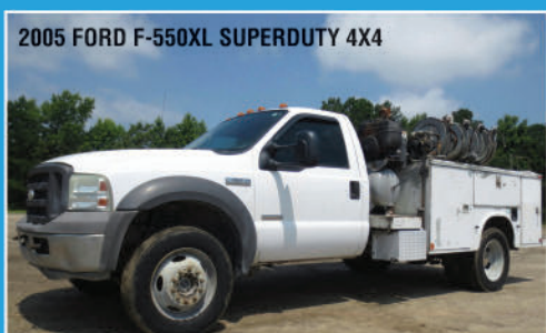
2005 FORD F-550XL SUPERDUTY 4X4

Ranger 5TC aerial boom, sn:2000511841, 60 ft working height reach capability, material handler, tow package, odometer reading: 118,134 miles