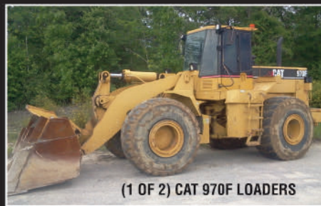
(1 OF 2) CAT 970F LOADERS