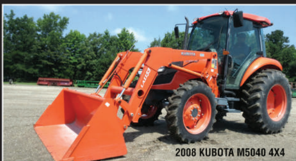
2008 KUBOTA M5040 4X4