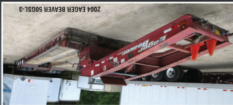
2004 EAGER BEAVER 50GSL-3