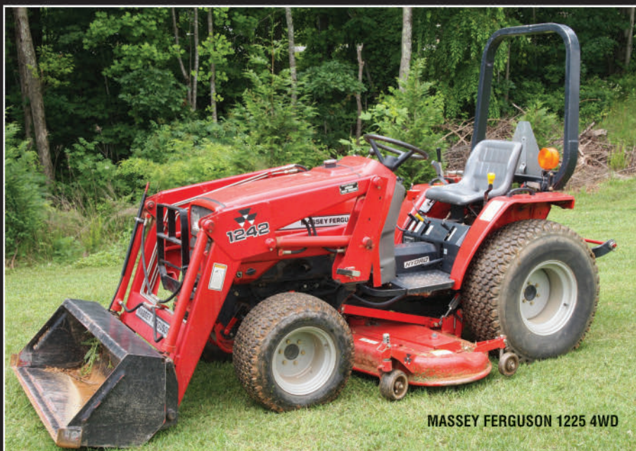
MASSEY FERGUSON 1225 4WD

American Compaction Wheel Excavator Attachment , sn:AD04039, 36 inch working width capability, fits 40,000LB to 45,000LB size hydraulic excavators