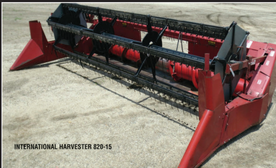
INTERNATIONAL HARVESTER 820-15

Descriptions at our company website: www.meekinsauction.com