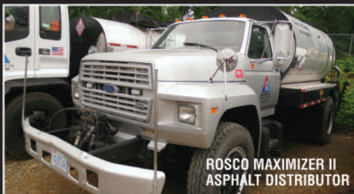
ROSCO MAXIMIZER II ASPHALT DISTRIBUTOR