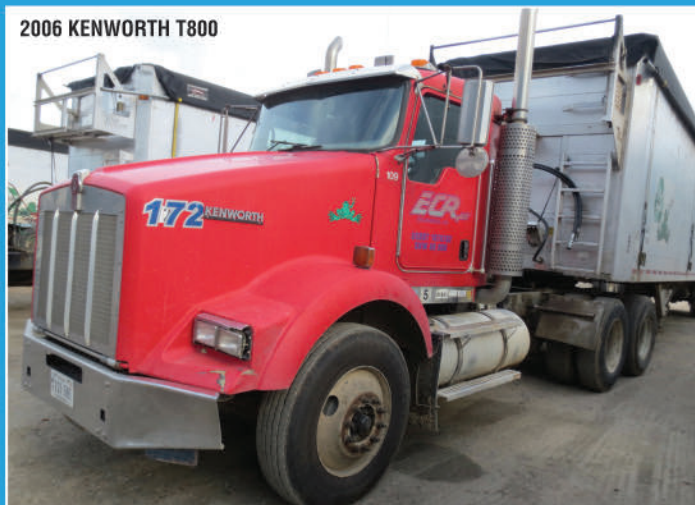
2006 KENWORTH T800