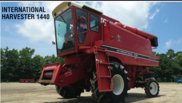
INTERNATIONAL HARVESTER 1440