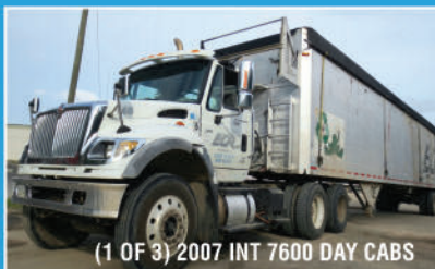
(1 OF 3) 2007 INT 7600 DAY CABS