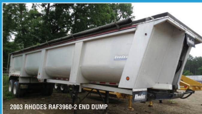
2003 RHODES RAF3960-2 END DUMP

Descriptions at our company website: www.meekinsauction.com