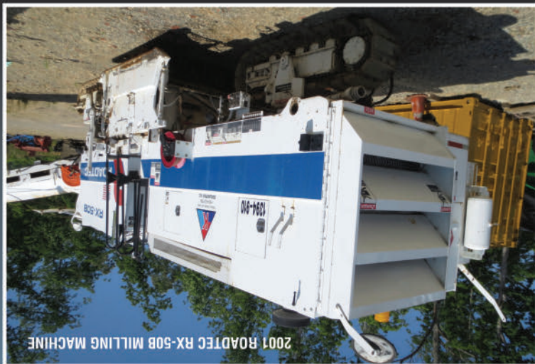
2001 ROADTEC RX-50B MILLING MACHINE