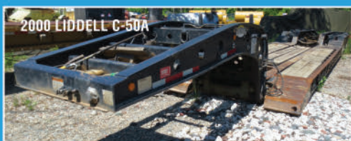
2000 LIDDELL C-50A