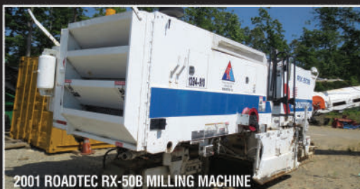
2001 ROADTEC RX-50B MILLING MACHINE