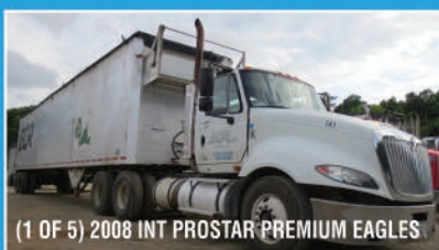
(1 OF 5) 2008 INT PROSTAR PREMIUM EAGLES