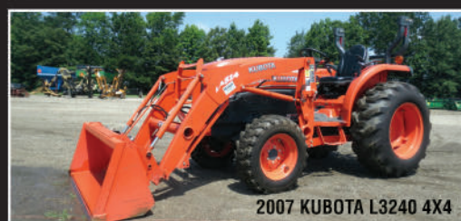
2007 KUBOTA L3240 4X4

Descriptions at our company website: www.meekinsauction.com