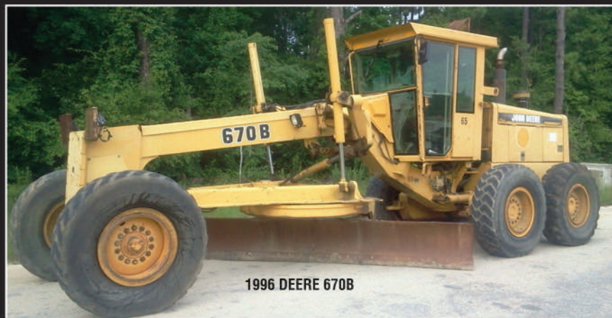
1996 DEERE 670B