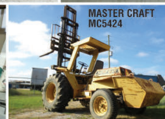
MASTER CRAFT MC5424