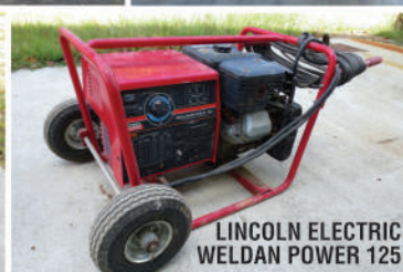
LINCOLN ELECTRIC WELDAN POWER 125