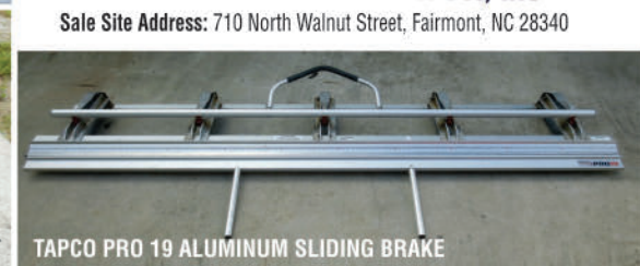
TAPCO PRO 19 ALUMINUM SLIDING BRAKE