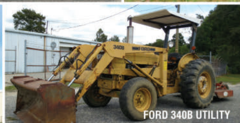
FORD 340B UTILITY