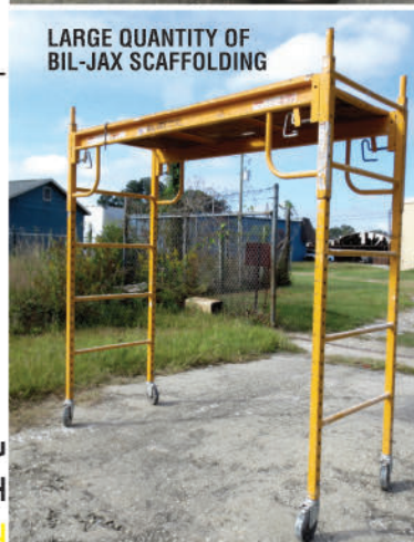
LARGE QUANTITY OF BIL-JAX SCAFFOLDING