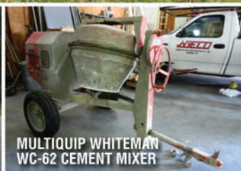
MULTIQUIP WHITEMAN WC-62 CEMENT MIXER