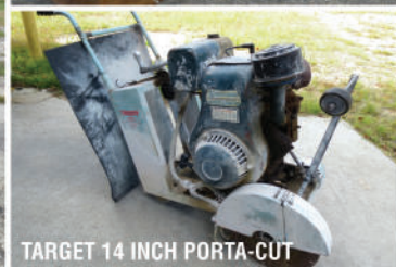
TARGET 14 INCH PORTA-CUT