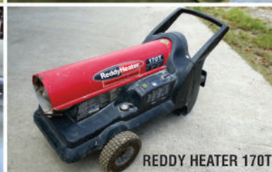
REDDY HEATER 170T