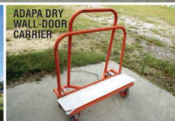
ADAPA DRY WALL-DOOR CARRIER

Auction Conducted By: Lloyd Meekins & Sons Auction Company