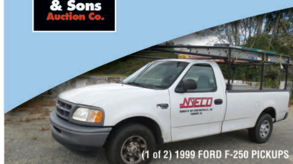
(1 of 2) 1999 FORD F-250 PICKUPS

Sale Site Address: 710 North Walnut Street, Fairmont, NC 28340