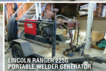
LINCOLN RANGER 225G PORTABLE WELDER GENERATOR