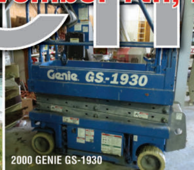
2000 GENIE GS-1930